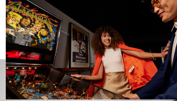
GAMES ROOM - 5TH FLOOR