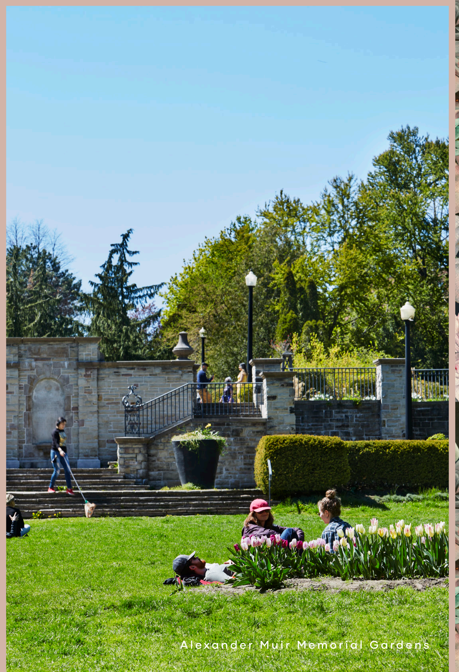
Alexander Muir Memorial Gardens