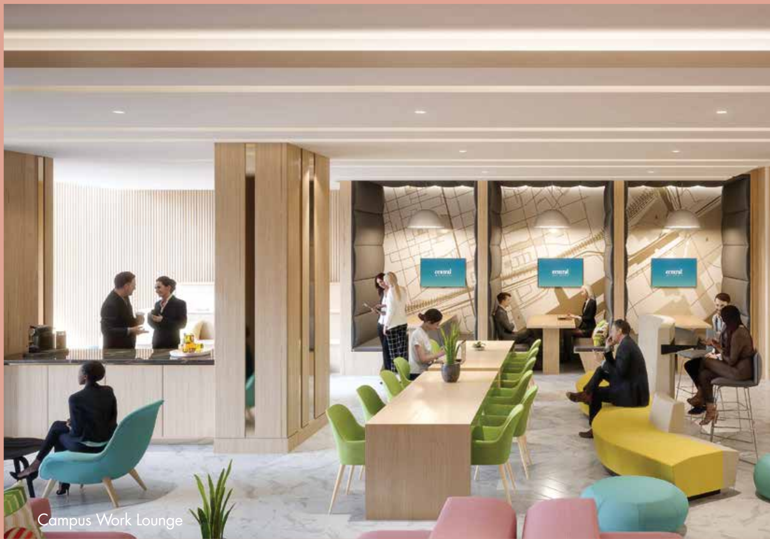
Campus Work Lounge