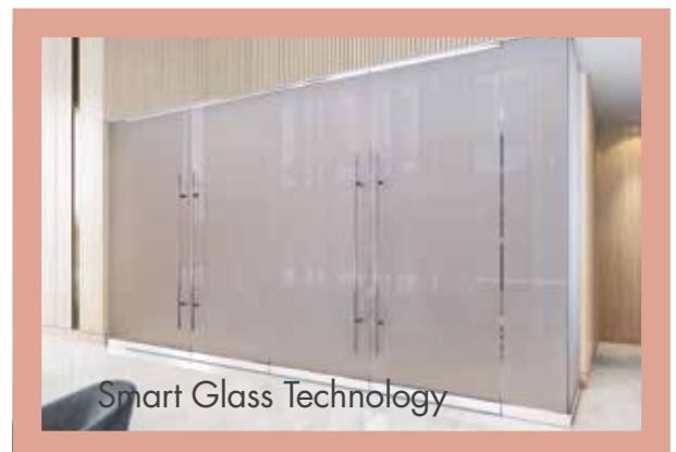
Smart Glass Technology