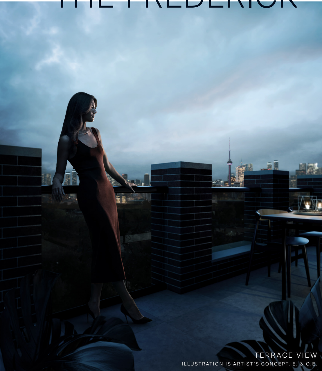
TERRACE VIEW ILLUSTRATION IS ARTIST'S CONCEPT, E. & O.E.